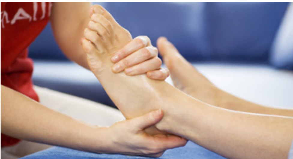
The foot has a greater quantity of sensitive nerve endings than other body parts.

Although simplistic in application, the effects of the treatment can be profound. Through activation of nerve receptors in the hands and feet, new messages flood into the body system, changing its tempo and tone. In essence, the foot or hand becomes a conduit for sharing information throughout the